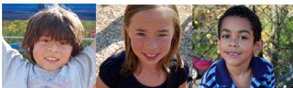
Be a Reader.