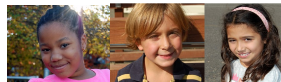
Be a Problem Solver.