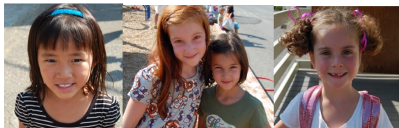
Be a Writer.