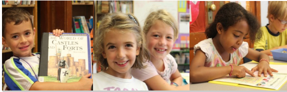
Be a Reader.