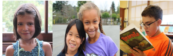
Be a Writer.