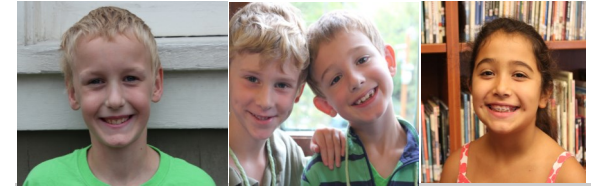
Be a Problem Solver.